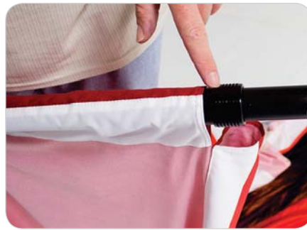
STEP8 Extend the top and bottom pole to desired length.