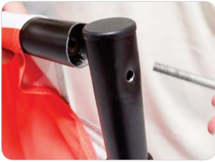
STEP7 Screw tight with each side pole.