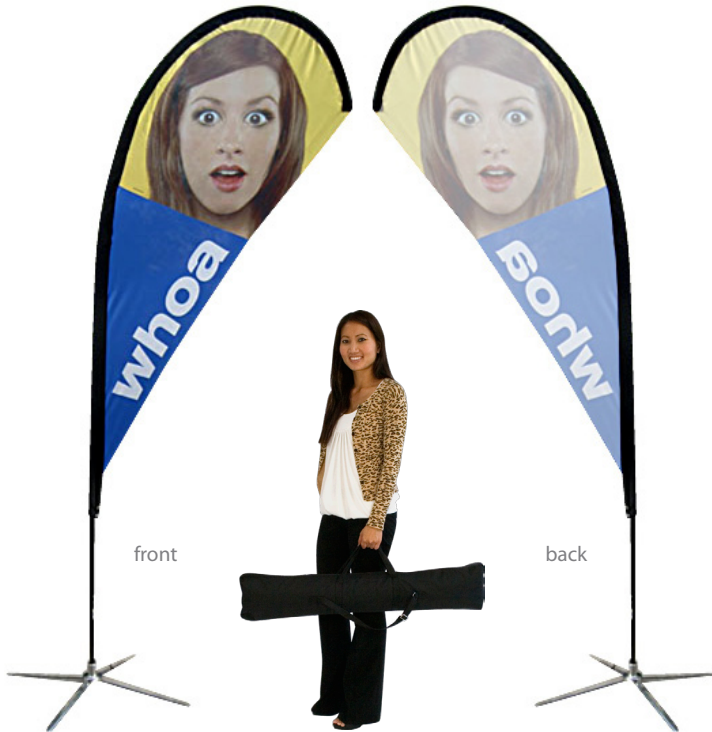
Feather / Teardrop banner stands size comparison