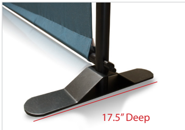
Sturdy Steel "Bridge" Support Base.