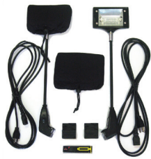
*Optional 200 watt halogen lights