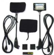
*Optional 200 watt halogen lights