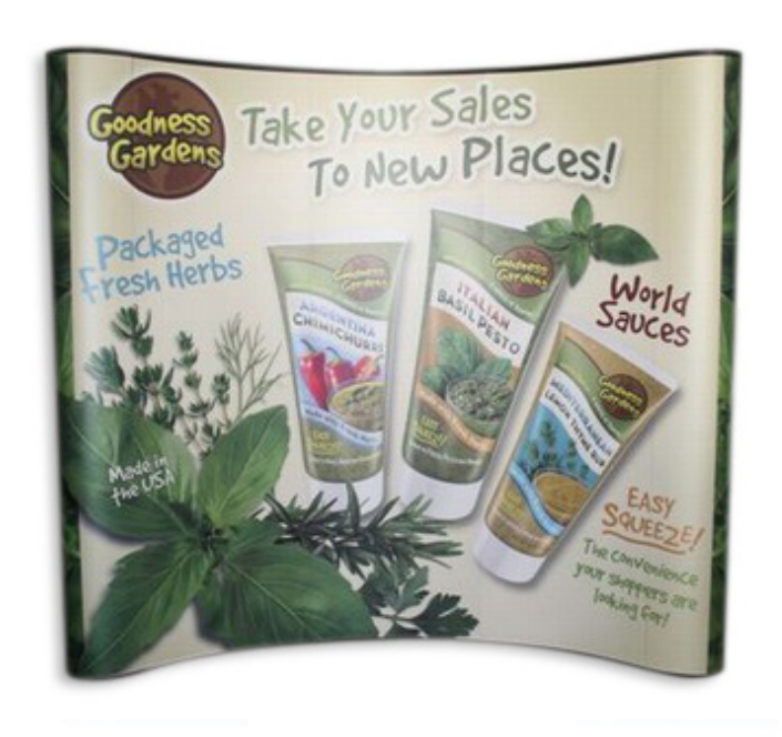
*Podium graphic is optional.